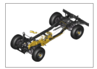
PN 6097556 CTIS (CENTRAL TIRE INFLATION) LESS ARMOR WITH A/C (AVAILABLE ONLY WITHOUT ABS)