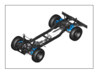
PN 6104207 ENHANCED SPRINGS (FRONT & REAR) TO ACHIEVE 14,100 LB. GVW