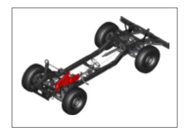
PN 12518431 SPLASH SHIELD (LH)