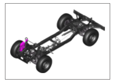
PN 12506964 SPLASH SHIELD (RH)